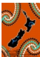
Aotearoa (Land of the Long White Cloud) New Zealand

A range of works currently available for sale. All enquiries welcome.